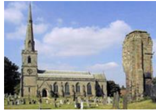
St. George's Church, Church Lane, Ticknall, DE73 7JU

St. George's Church is at the end of Church Lane, off the A514 Burton Road in Ticknall village.